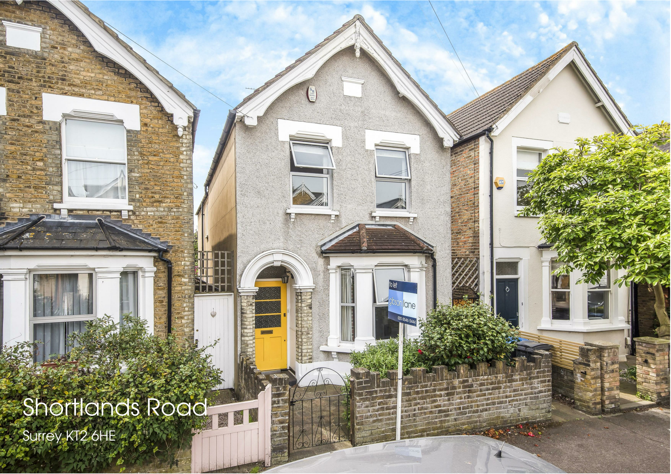
Shortlands Road Surrey KT2 6HE