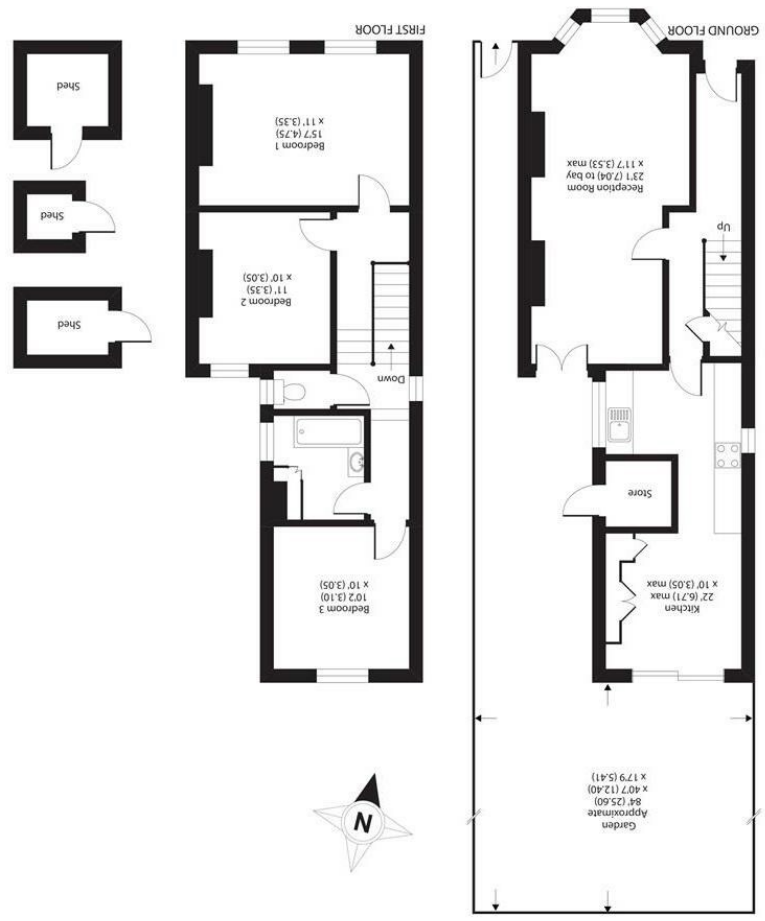
APPROX. GROSS INTERNAL FLOOR AREA 1131 SQ FT 105 SQ METRES (EXCLUDES OUTBUILDINGS & STORE)

34 Richmond Road Kingston upon Thames Surrey KT2 6ED www.gibsonlane.co.uk Tel: 020 8546 5444